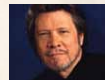
Samuel Ramey Timur

SUBSCRIBE TODAY and get 4 operas for the price of 3!