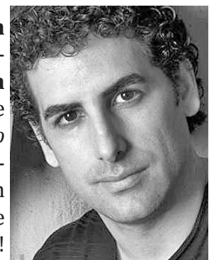
Juan Diego Florez

At Disney Hall, the Los Angeles Philharmonic will welcome pianist Yefim Bronfman and conductor Zubin Mehta for a performance of the Bartok Piano Concerto and Beethoven's Symphony No. 3 . Come with us and check out the acoustics!